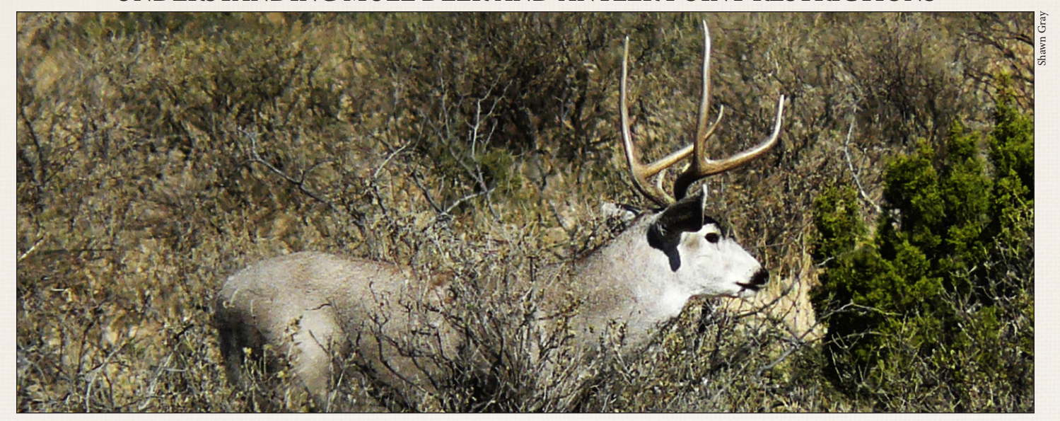
Antler point restrictions often fail to provide the intended benefit as this large two-point mule deer buck is not typically what hunters aspire to create or maintain with antler point restrictions.