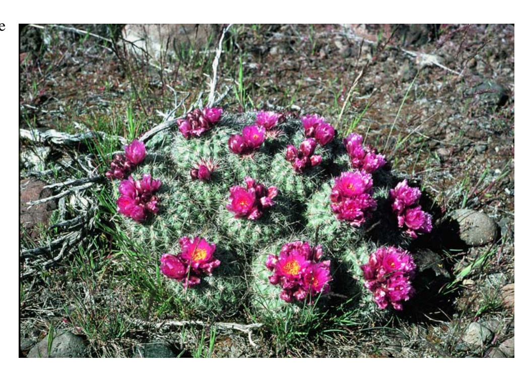
Hedgehog cactus in Shrub-steppe

Shrub steppe – The majority of the arid portions of the Colockum Wildlife Area is comprised of shrub steppe habitat (predominantly sagebrush and/or bitterbrush mixed with various bunchgrasses). Certain portions exhibit some of the state's best remaining native shrub-steppe communities. This cover type will be significant in WDFW's future sage grouse restoration efforts.