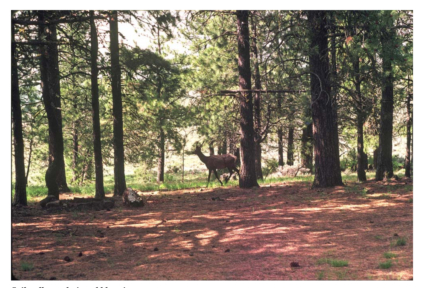
Spike elk wandering old hunting camp

The Colockum Elk Herd plan (2005) is currently in draft with expected completion due in the spring of 2006. Herd objective goals (4275-4725 elk) were laid out in the WDFW's 2003-2009 Game Management Plan (2003) with the Colockum plan providing detailed guidance in herd management. The Colockum Wildlife Area Plan and Colockum Herd Plan will have interactive management to insure both are in alignment. Ensuring habitat protection, habitat enhancement and limiting human disturbance are critical functions the Wildlife Area Manager will have to deal with for both plans to be successful. Specific items needing management actions include: livestock grazing management, vehicle access management, fire protection, management of old agricultural fields and management of the Coffin Reserve etc.