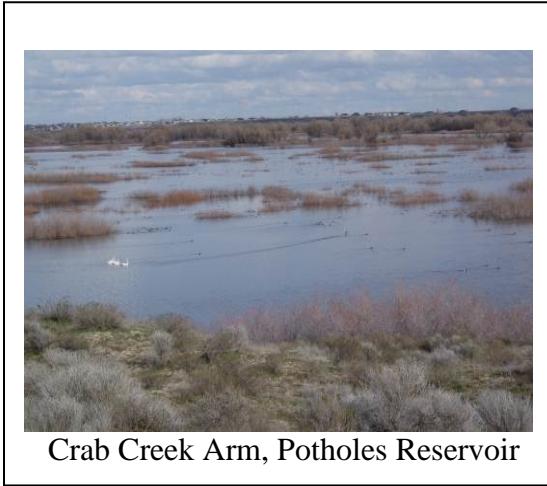
Crab Creek Arm, Potholes Reservoir

Washington Department of Fish and Wildlife