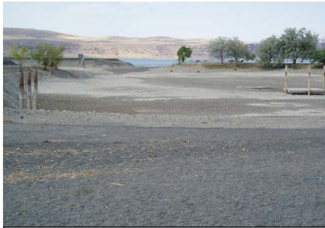
Coulee City Marina, Banks Lake

In order to make repairs to the outlet gates from Banks Lake reservoir into the Main Canal, the U.S. Bureau of Reclamation (BOR) lowered the water level of Banks Lake 35 feet through the late fall and winter of 2011. BOR closed vehicle access to several access areas and boat access to the lake was severely curtailed. BOR closed the Barker Canyon Access Site to vehicle access to prevent potential damage to cultural resources. The plan is for Banks Lake to be back to full pool by the start of the irrigation season early in March 2012.