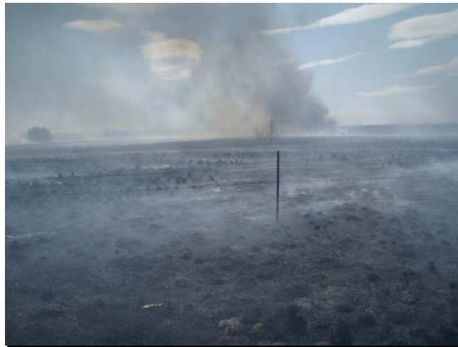
Winchester Lake Fire

For the past several years, CBWA has provided two portable outhouses for the public using the Frenchman Coulee rock climbing area. Vandalism and safety issues prompted the vendor to discontinue service and the outhouses were removed. A coalition of rock climbing clubs approached the Department of Fish and Wildlife (WDFW) with a proposal to fund the installation an above-ground vault toilet. Installation and landscaping is anticipated for early spring 2013.