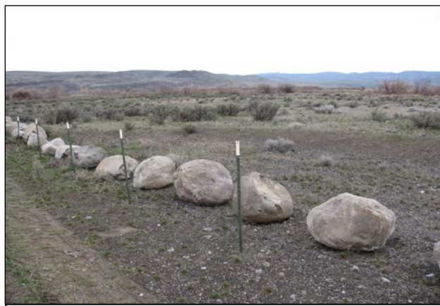
Vehicle barrier, Priest Rapids Unit

Steel-rail gates and barrier rocks were installed to eliminate unauthorized off-road travel, trash dumping and vandalism. In the Gloyd Seeps Unit, CBWA staff installed a gate at the Mansfield Pond parking area to prevent off-road vehicle activity and at the Road 10 East parking area to curtail trash dumping. Barrier rocks were added around the south parking area and access road in the Quincy Unit. The CBWA worked with Grant PUD to develop a plan to prevent vehicle access off the main access road in the Priest Rapids Unit. Grant PUD installed gates at the parking area and barrier rock along the entire length of the access road.