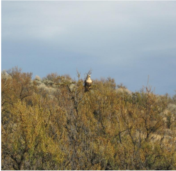
Rough-legged Hawk on the MWA Fraser Unit