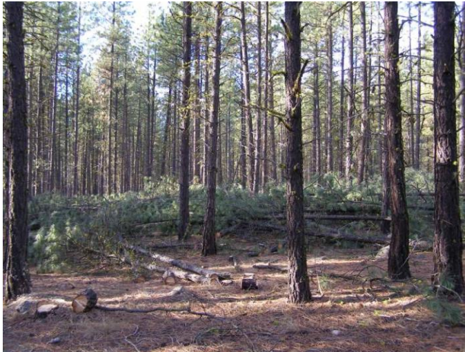
Ponderosa pine thinning at the Bear Creek Campground

Water rights were temporarily donated to the Washington State Trust Water Rights Program to secure instream flow protection for water associated with the Judd Ranch (Texas Creek WL Unit, Methow River) and Patterson Place (Methow WL Unit, Beaver Creek). The water temporarily donated to Washington Water Trust (WWT) is to be used exclusively to enhance instream flows for fish maintenance and enhancement, recreational uses, or preservation of environmental and aesthetic values (“Trust Water Rights”), as allowed under RCW Chapters 90.03, 90.42, and 90.54. A clause was included in the contract that allows WDFW to remove water rights from WWT if funding and necessity become available.