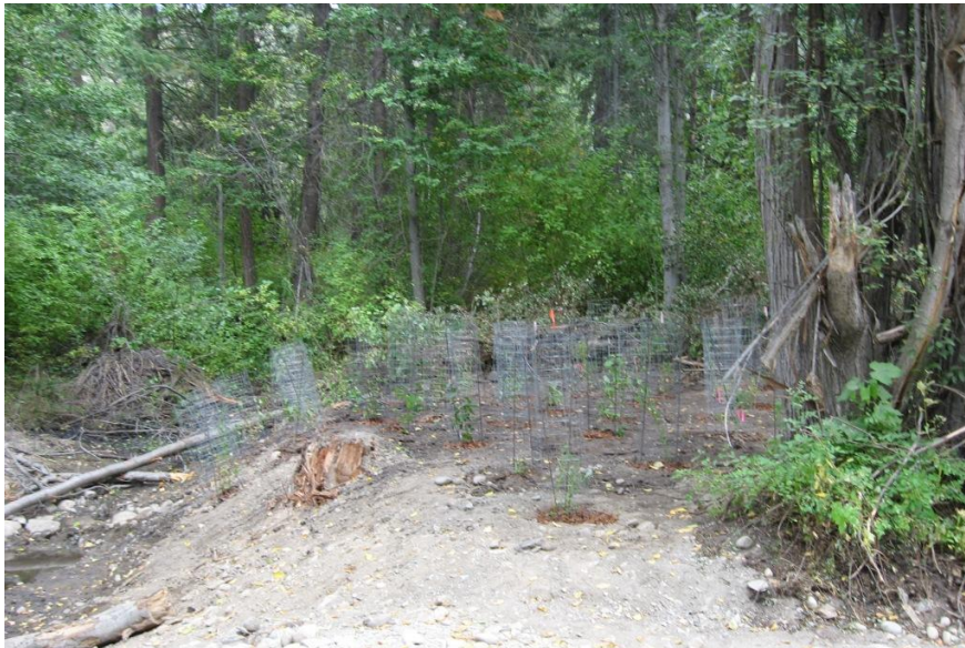
Cougar creek culvert replacement shrub plantings

We continue to control, inventory, and map weed populations on the wildlife area. In 2009 emphasis will be placed on the wildlife area's popular right-of-ways. In 2008, approximately 350 acres of weeds were treated using Integrated Pest Management (IPM) control methods, which include mechanical farming, mechanical hand pulling, release of biocontrols, and chemical treatments. New noxious weed identification and suggested treatments informational public signs have been developed, in partnership with the USFS, and will be posted on the MWA kiosk boards and entrances to wildlife area's units in 2009.