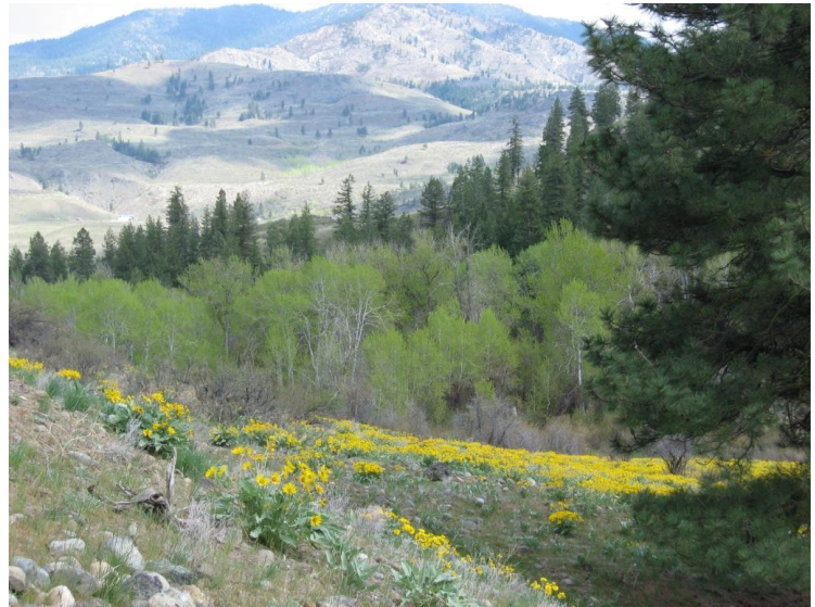
The Richner Acquisition for the MWA Golden Doe Unit

In early 2009, the WDFW purchased approximately 423 acres of upland shrub steppe and riparian habitats. This acquisition is located on the southern border of the MWA's Golden Doe unit. The new property provides key critical mule deer habitat and improves recreational opportunity and access to the MWA's Golden Doe unit.