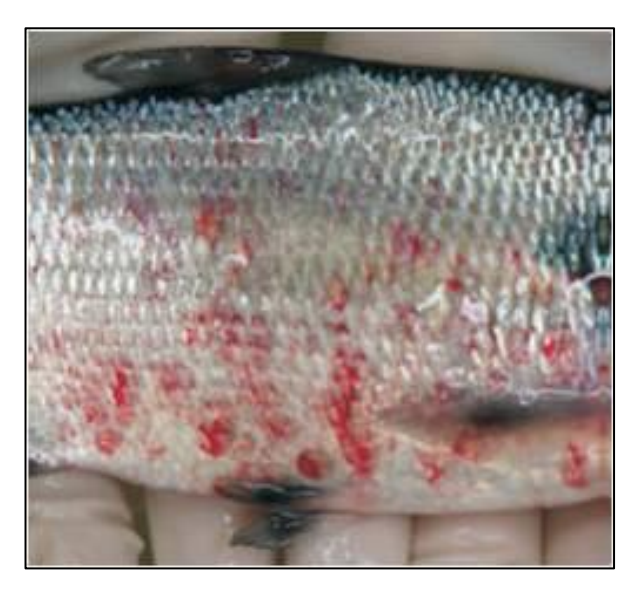
Figure 5. VHS pathogen causing hemorrhaging on fish skin in Great Lakes region.

WDFW AIS Prevention and Enforcement boater education and inspection program plays an important role in stopping the spread of pathogens as well as AIS by educating boaters to drain all