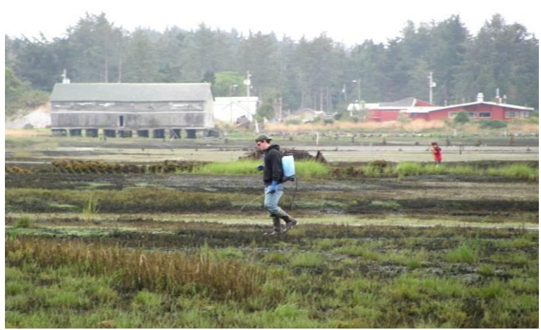
Figure 12. Two Spartina crew members searching for scattered plants intermixed with native vegetation.

With the largest of the state's infestations now controlled, the effort has evolved into a 'survey and eradicate' model focused on finding and treating the remaining individual plants and scattered infestations that exist throughout the previously infested area. This requires significant personnel on the ground to give individual attention to the same areas that helicopters or large machines were previously able to cover in a relatively short amount of time. The amount of herbicide needed to