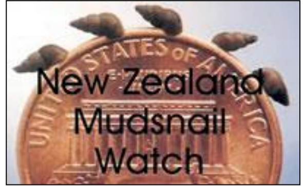
Figure 6. New Zealand mudsnails at Capitol Lake