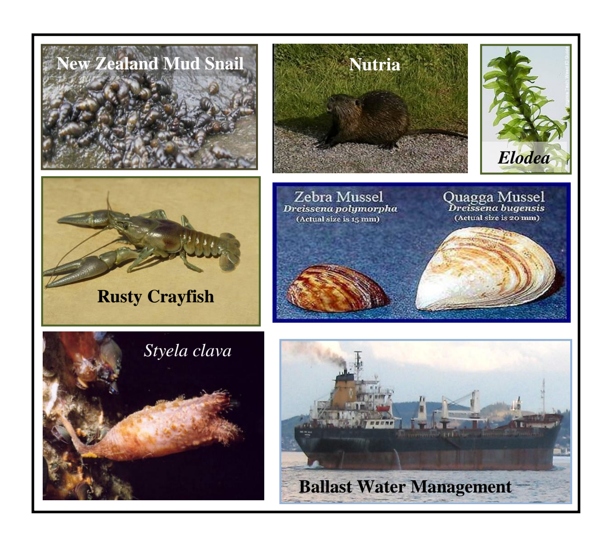
Prepared by Pam Meacham and Allen Pleus Washington Department of Fish and Wildlife