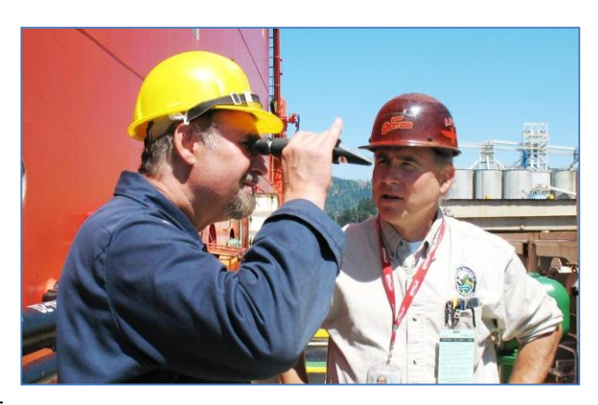
Figure 3. WDFW ballast water inspector (right) showing vessel crew how to measure salinity levels in ballast tank.

Open ocean exchange is the current method used by vessels to reduce the number of potentially invasive coastal organisms in a ballast water tank. This requires emptying and refilling ballast tanks or pumping three times the capacity of the tank through the tank to exchange coastal water for deep sea water. The intent is to exchange 100% of potentially invasive coastal species for deep ocean species that would have less chance of survival in our The configuration of ballast water tanks tends to create "dead" spots where water does not get flushed out when the flow through method is used, and there is always some water remaining in a ballast tank when as much water as possible has been pumped out.