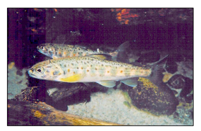
Figure 11. Juvenile Atlantic salmon escapees from a hatchery.

Initially snorkel surveys were conducted during the summer months. The program was later