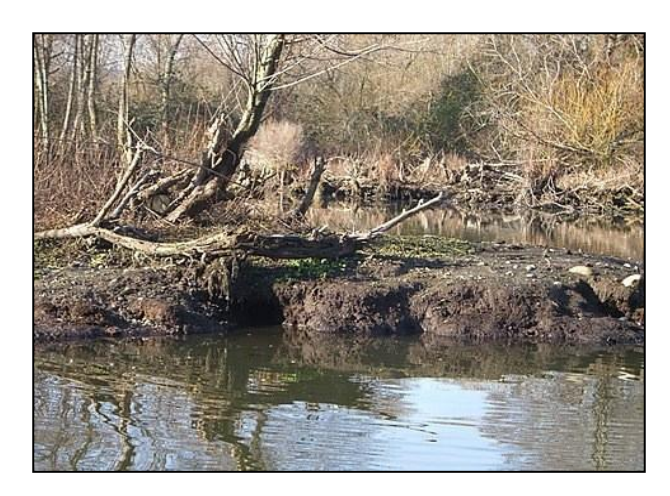
Figure 4. Nutria damage on lake bank.

Reports of nutria sightings and property damage are on the increase throughout Western Washington urban areas, and in the tri-cities area of central Washington. Nutria girdle trees and shrubs, dig up lawns and golf courses, and cause erosion along streams by destroying vegetation that holds soils together (Figure 4). They do not have a fear of humans, and a 2007 report developed by Portland State University cited isolated cases of nutria attacks.