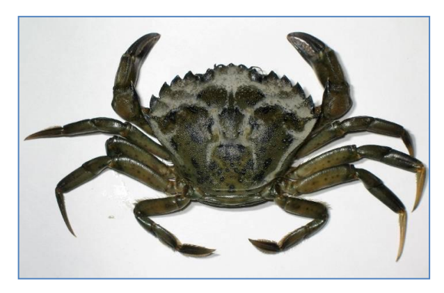
Figure 9. European green crab – Photo by B.C. Shellfish Growers Association.

and the Puget Sound program was focused on monitoring for presence and absence.