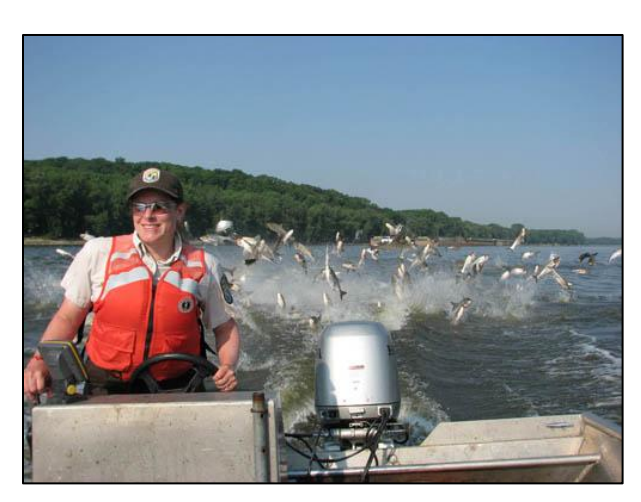
Figure 8. Silver carp jumping out of water due to disturbance of boat going past.

Five species of Asian carp occur in the United States. Common carp ( Cyprinus carpio ) are ubiquitous throughout the country and, although not desirable, are considered part of the native fish community. Grass Carp ( Ctenopharyngodon idella or white amur) were imported from Asia to control aquatic vegetation in aquaculture ponds. In the Mississippi river area they have escaped and become a major problem. In Washington diploid grass carp are allowed to be introduced for vegetation control under permit from WDFW.