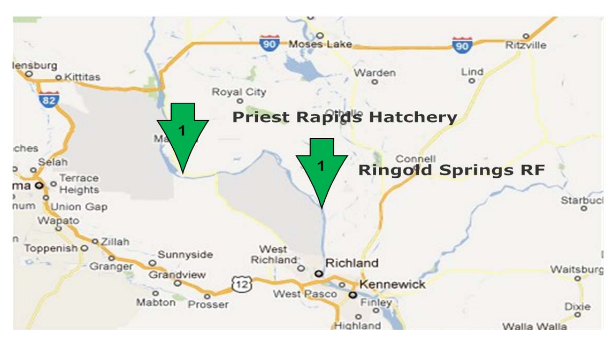
Figure 1. Project Area Map.

The Hanford Reach is a 56-mile segment of the Columbia River located between the upstream end of McNary Dam reservoir and Priest Rapids Dam. It is the only sizeable non-impounded reach of the mainstem Columbia River upstream of Bonneville Dam. Fall Chinook salmon continued to successfully use Hanford Reach spawning and rearing habitat as other production areas became inundated by reservoirs. The Hanford Reach produces the most significant natural production of URB fall Chinook salmon in the mainstem Columbia River. Broodstock collection, adult holding, spawning, incubation, rearing, and release occur at the PRH on the Columbia River at river mile (RM) 397. Release of acclimated sub-yearling smolts from the RSRF occurs at river mile (RM) 352.