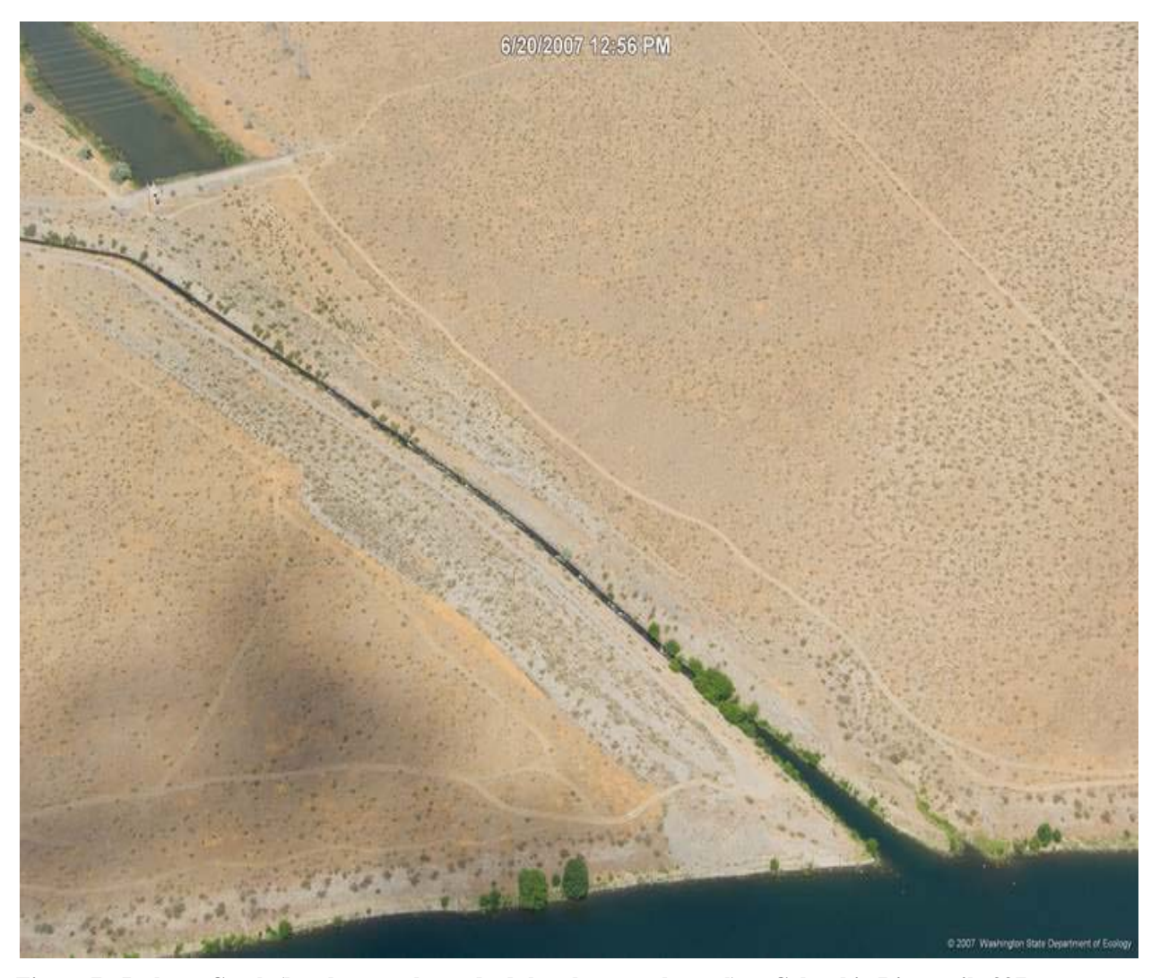
Figure 7. Jackson Creek (hatchery outlet and adult volunteer channel) at Columbia River mile 397.