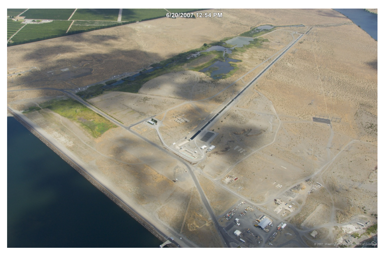
Figure 5. Priest Rapids Hatchery and the original spawning channel.

The original spawning channel at PRH was constructed to voluntarily attract adult fall Chinook and provide natural spawning habitat. Fish failed to use the channel as designed and this resulted in modifications to the channel and ultimately 5 rearing ponds were constructed in the upper end of the channel. These ponds are used today for Grant County PUD's mitigation obligation as well as rearing 1.7M fall Chinook for the USACE.