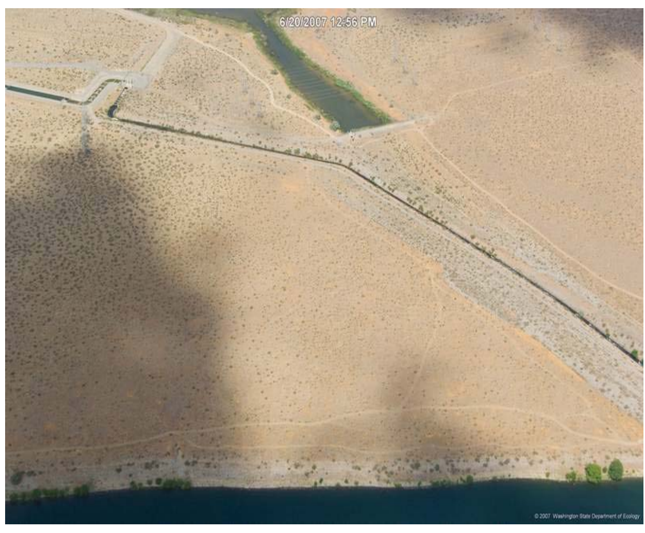
Figure 6. Existing volunteer trap at Priest Rapids Hatchery on Jackson Creek outlet channel.

The adult volunteer trap (AVT) at PRH is located on the Jackson Creek hatchery outlet channel about one mile from the Columbia River. The AVT was reconstructed in 2013 and modified further in 2014 to improve trapping/fish handling operations. Fish access into the trap is controlled by an adjustable finger weir. Two movable crowders are used to push fish into a pescalator which lifts fish [in water] from the trap and discharges them into a fish transport tank truck. Fish are then transported about a mile to the adult holding ponds next to the incubation building to be held for broodstock or to be surplused.