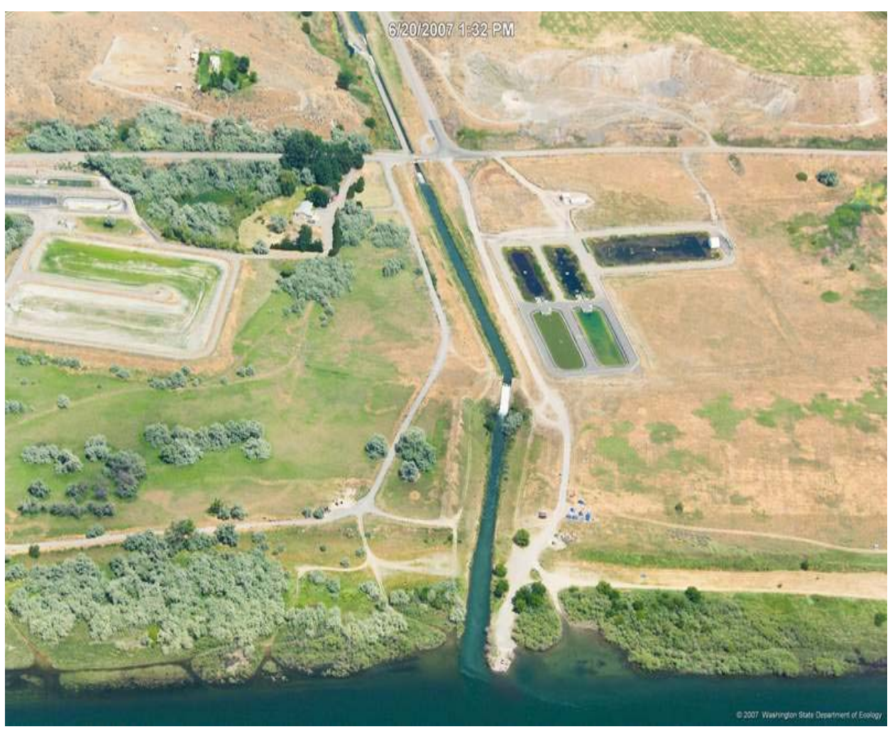
Figure 4. RSRF – Walter's Ponds and the 5-Acre Pond (upper left), USBR Ringold irrigation wasteway (center), and the five Meseberg warmwater ponds (right).

Ringold's 5-acre rearing pond is a horseshoe-shaped earthen pond. The gravity water supply, known as the "Steelhead Diversion", is also located next to the county road, but is separate from the RSRF Main Diversion and Lower Diversion. This pond has a concrete flume downstream of the outlet structure which allows the use of an electronic fish counter for enumerating steelhead smolts at release.