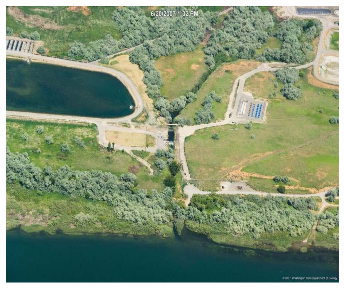
Figure 3. RSRF 9-acre pond, outlet structure, fish trap, 2 concrete raceways and 32 blue round tanks.

RSRF's adult fish trap consists of two picket weirs constructed in the hatchery outlet creek (visible in Fig. 3). The downstream weir has a vee-shaped fish entrance which allows upstream movement of fish while preventing downstream movement.