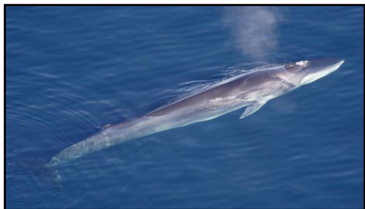
Figure 2. Fin whale.

Fin whale. This is the second largest species of whale, reaching lengths of 22–27 m (72–89 ft) and weights of 60,000–90,000 kg (66–99 tons) (Deméré 2014). Animals in the Southern Hemisphere are larger than those in the Northern Hemisphere, and females are 5–10% larger than males. Fin whales have a long sleek head and body and a noticeable dorsal fin. Body coloration is dark gray on the back and flanks and white beneath, with several pale gray V-shaped markings on the back behind the head (Figure 2; Shirihai and Jarrett 2006).