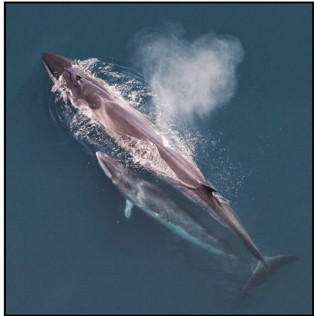
Figure 3. Sei whale mother and calf.

Sei whale. Sometimes described as the most graceful of whales (Haldane 1909), sei whales are a medium-sized rorqual that attains lengths of 17–20 m (56–66 feet) and weights of 22,000–38,000 kg (24–42 tons) (Deméré 2014). Females are somewhat larger than males and animals in the Southern Hemisphere are larger than those in the Northern Hemisphere. The species features a long streamlined head and body, a relatively tall and distinctively erect dorsal fin, and coloration that is dark bluish-gray to black above and whitish below (Figure 3; Shirihai and Jarrett 2006).