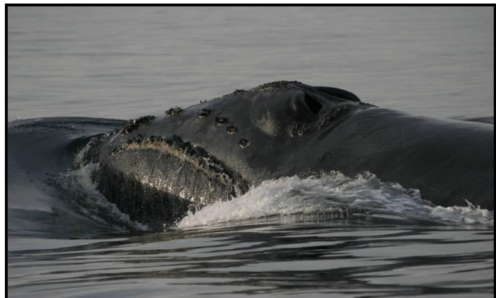
Figure 4. North Pacific right whale.

North Pacific right whale. A large baleen whale, adults grow to lengths of 15.0–18.5 m (49–61 ft) and weights in excess of 80,000 kg (88 tons) (Shirihai and Jarrett 2006, Ivashchenko and Clapham 2012, Deméré 2014). Females are larger than males. Compared to rorqual whales, right whales have a much more rotund body shape, lack an expandable pleated throat, and have much taller baleen plates. North Pacific right whales have a large head, narrow rostrum, highly arched mouthline, broad pectoral fins, smooth back without a dorsal fin, and a large well-notched tail. Coloration is typically blackish overall (Figure 5), although some