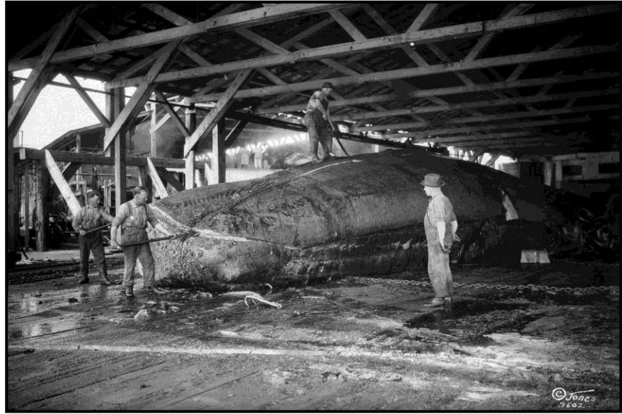
Figure 6. Processing a sperm whale at the Bay City whaling station at Bay City, Washington, circa 1920.

1925 (Figure 6), and six stations in British Columbia, with the last closing in 1967 (Scheffer and Slipp 1948, Crowell 1983, Gregr et al. 2000). More than 27,500 whales were processed at these stations (Table 2). Catcher vessels from the Bay City facility operated mostly within 220 km of Grays Harbor, thus covering the coasts of Washington and northern Oregon, but sometimes ventured as far as southern Oregon and Vancouver Island (Scheffer and Slipp 1948, Crowell 1983). Historical catch records and other materials from this operation and the Canadian stations are held at the Special Collections library, University of Washington, Seattle.