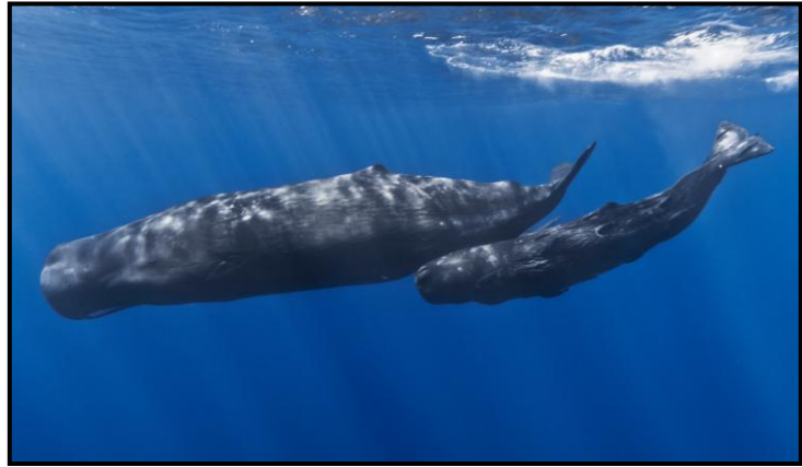
Figure 5. Sperm whale mother and calf.

Sperm whale. This is the largest species of toothed whale. Adult males measure 15.2–19.2 m (50–63 ft) long and 45,000–70,000 kg (50–77 tons) in weight and are substantially larger than adult females, which reach 10.4–12.5 m (34–41 ft) long and 15,000–24,000 kg (16.5–26 tons) in weight (Mesnick 2014). Sperm whales have massive rectangular heads that comprise about one-third of the total body length in males. The head is often marked with pale scarring and has a comparatively small, narrow lower jaw with conical teeth. Other traits include a small triangular dorsal fin, a ridge of smaller “knuckles” along the upper tail stock, broad triangular tail flukes, dark brownish-gray to black body coloration except for a whitish mouth and genital region, and a wrinkled appearance to the skin (Figure 5; Shirihai and Jarrett 2006).