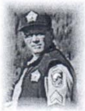
WDFW Detachment 10 King County