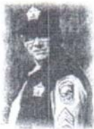
SERGEANT WDFW Detachment 10 King County