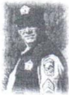
SERGEANT WDFW Detachment 10 King County