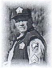
WDFW Detachment 10 King County