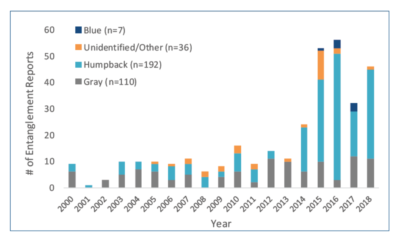
NOAA: Confirmed US west coast whale entanglements by year and species, 2000 to 2018

The Department is requesting $172,000 ongoing to meet the needs of the coastal commercial crab fishery, as well as the needs of humpback whales. The Governor's proposed supplemental budget provides full funding from a mix of state general fund and the Washington Coast Crab Pot Buoy Tag Account to achieve this goal.