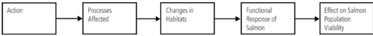
Figure 1. General Nearshore Science Team Conceptual model applied to salmon.