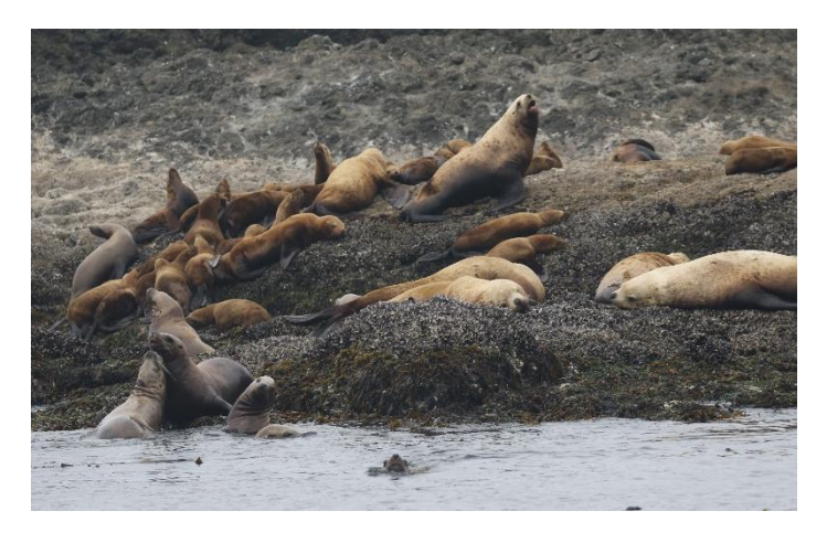
Figure 1. Steller sea lions ( Eumetopias jubatus ).

Steller sea lions are one of the largest pinniped species and are substantially larger than California sea lions (Zalophus californianus), which also occur in Washington. Descriptions of both species appear in Shirihai and Jarrett (2006), Jefferson et al. (2015) and Wynne (2015). The Steller sea lion was listed as threatened both federally and in Washington in 1993 (WDW 1993). The National Marine Fisheries Service (NMFS) divided the species into two DPSs (see below) in 1997, reclassifying the western DPS as endangered. The eastern DPS of Steller sea lions was federally delisted in 2013 (NMFS 2013), while the western DPS remains classified