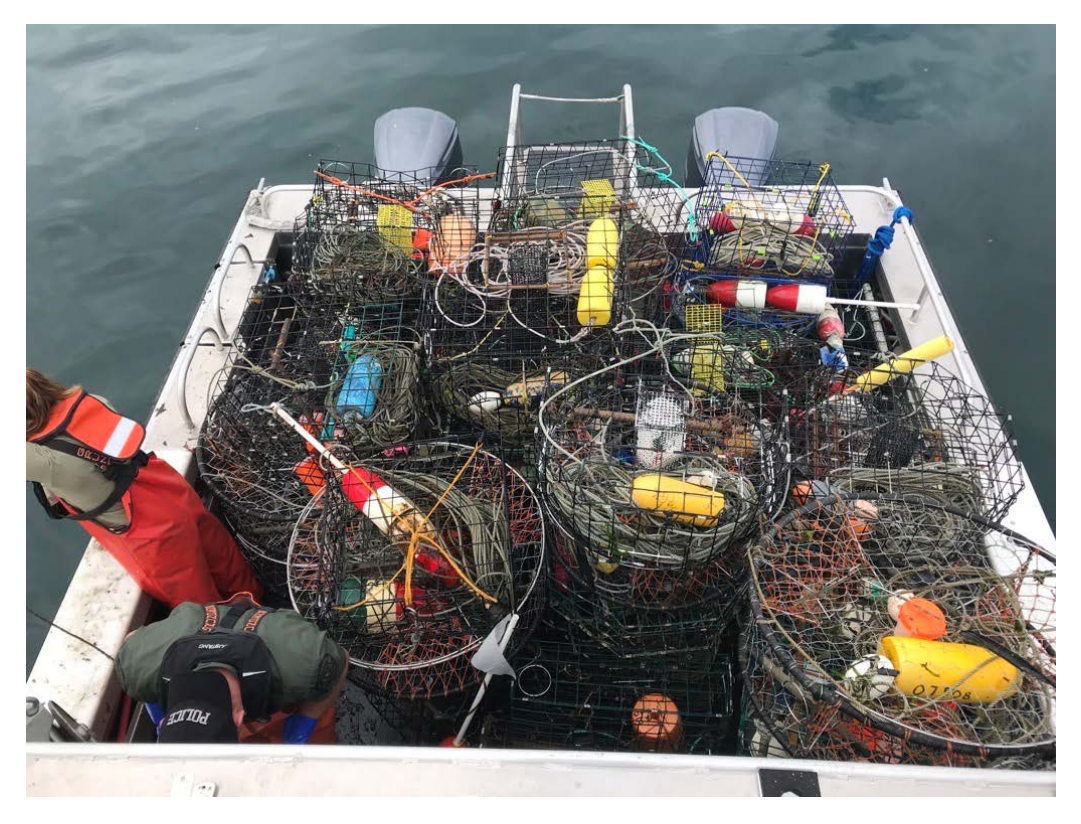
Figure 2. Recovered derelict pots stacked on the back deck of the WDFW R/V #699 during an enforcement gear sweep.