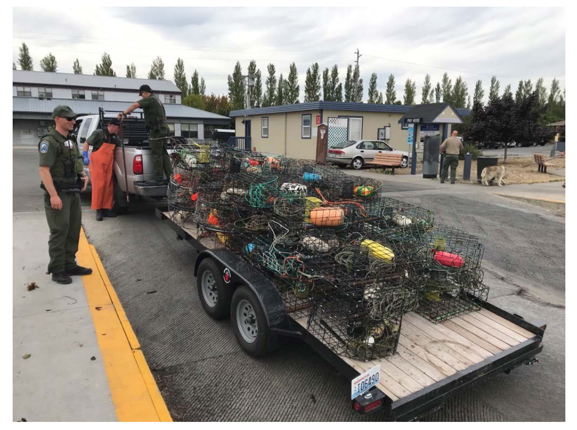
Figure 1. Recovered derelict pots on a trailer in Port Townsend following an enforcement gear sweep in 2021.

To fulfill requirements of RCW 77.32.430, dedicated derelict shellfish gear recovery funds expended in 2022: $244,035