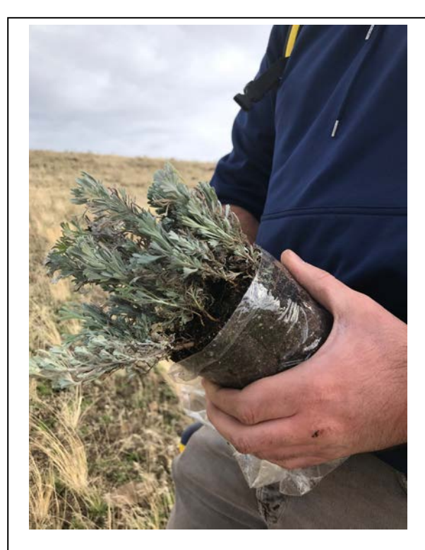
Figure 3. Sagebrush being planted.

Upland seeding on private land (~50 acres) With logistic help from the Foster Creek Conservation District, several pastures on a ranch in Douglas County that supports Sharp-tailed grouse leks and that burned in the Pearl Hill fire are being restored. Because of the fire, these pastures have been invaded by weeds that imperil surrounding grouse habitat. Weeds are being suppressed at these sites and then seeded with a native seed mix.