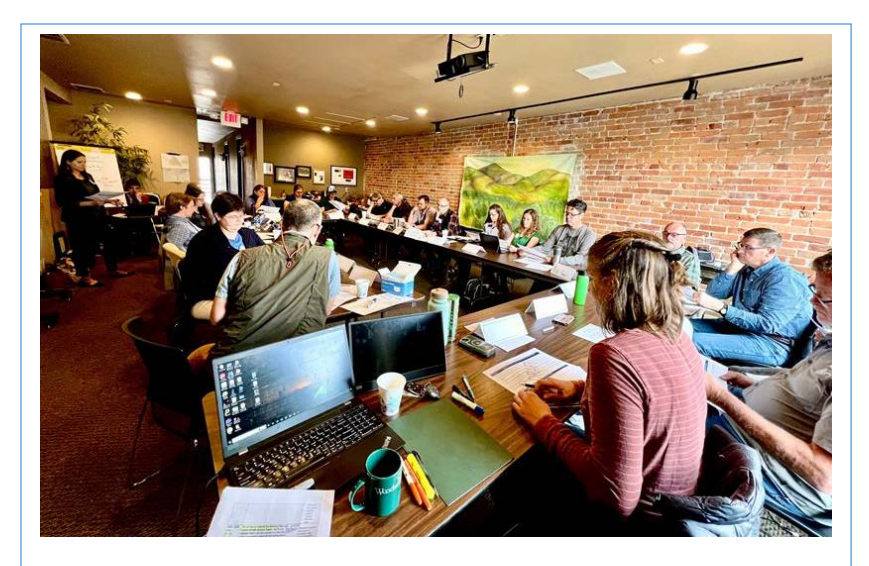
Figure 7. LTSAG working groups and Steering Committee meet in Wenatchee, Oct 2022.

The Wildlife Habitat Workgroup and Wildland Fire Workgroup began biweekly meetings in July of 2022. In October of 2022, a workshop was held in Wenatchee, Washington for the workgroups and Steering Committee to review initial objectives, discuss crossresource linkages that need further development, and workshop potential actions to achieve from the developed objectives (Figure 7). From this workshop the WSRRI Core Actions were developed.