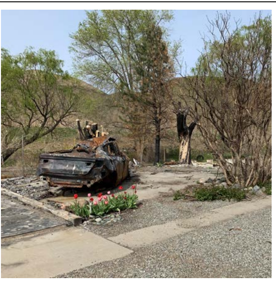
Figure 1. Pearl Hill fire devastation. Douglas County. Sept 2020 (left); April 2021 (right).