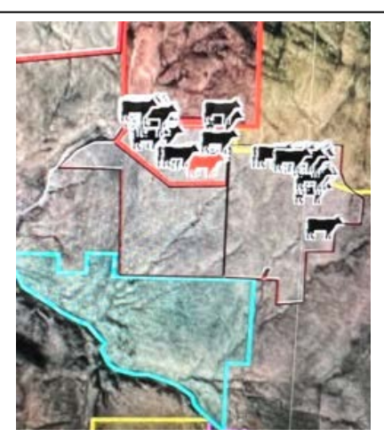
Figure 4. virtual fence receiving tower installation (left), receiving tower placement (center), and example user-interface for herd management (right).