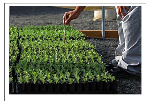
Figure 2. sagebrush plugs grown by SPP

WSSRI support of SPP to increase native plant material capacity is complemented by SPP-Evergreen Foundation support for academic