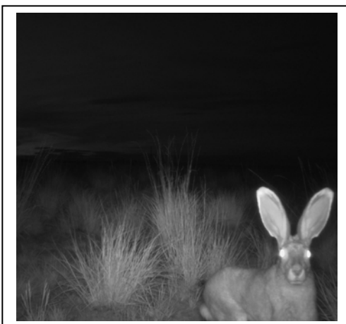
Figure 5. jackrabbit in remote camera image.

Partnering with Washington State University (WSU), WSRRI has contributed to research assessing shrubsteppe wildlife occupancy and the habitat characteristics of occupied areas in various land strata, including burned areas, using remote camera techniques (Figure 5). WSU has also received support from the Climate Adaptation Science Center that will allow them to focus additional sampling in burned areas and to develop climate models to examine how wildlife use human-disturbed landscapes in east-central Washington and how species might respond to future climate conditions by moving through the landscape.