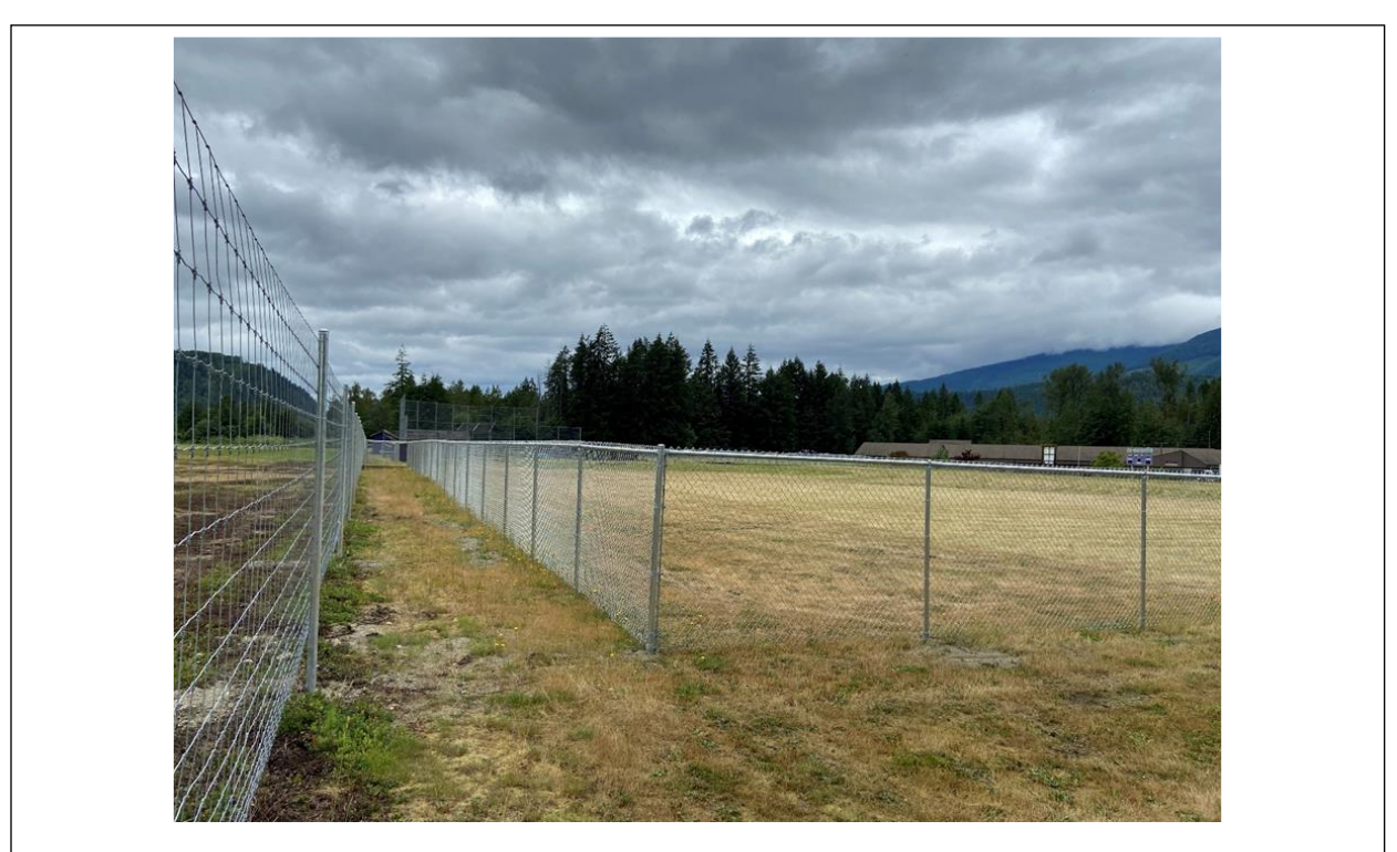
Photo detailing the two types of elk fencing installed by the Concrete School District. At this location, New Zealand style fencing extends along the school's southern boundary with the Concrete Municipal Airport, and chain link fencing surrounds the baseball field.

The Concrete School District was concerned that the New Zealand style elk fencing (woven wire) specified in the proviso language was not a safe option for fencing the school's athletic fields and stated a desire to use a combination of chain link (athletic fields) and New Zealand style fencing (school perimeter) for the school property. Because chain link fence does not match the fence type specified in the proviso language, the Department contacted the proviso's author, Senator Keith Wagoner. He stated that he felt the proposed modified design, a combination of chain link on interior portions of the school grounds and New Zealand style fencing around the perimeter, met the intent of the proviso.