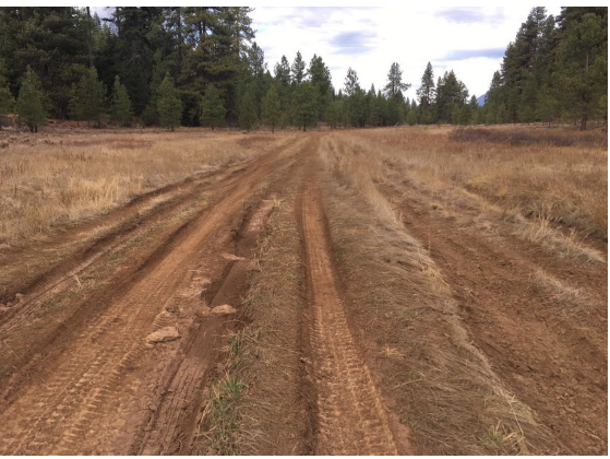
Figure 4. ORV tracks and damage at BLM's Moon Prairie in southern Oregon (photo by D. Keller, left image) and Midway Meadow in Gifford Pinchot National Forest, Washington (Kogut 2008).

Military training on JBLM-AIA. The closed, undeveloped nature of the JBLM-AIA, coupled with the frequency of low-intensity fires, has in some areas maintained significant patches of mardon skipper habitat. But in some areas frequent fires represent a significant threat to mardon skipper persistence. For example, Range 50 is an area where the largest remaining mardon skipper site occurs has burned consistently over the past three years (2021-2023) due to ignition from military training activities. Continued monitoring at this site will be critical to track changes. The frequency and type of use in the JBLM-AIA has changed over time. Over the past two decades, changes in military training needs have led to the development of new roads, and training and target structures (M. Linders, pers. comm.). Increased fire frequency and earlier fire timing (e.g., in June) mainly due to climate warming (see Climate Change section below) are also likely threats to mardon skippers and their habitat (R. Gilbert, pers. comm.).