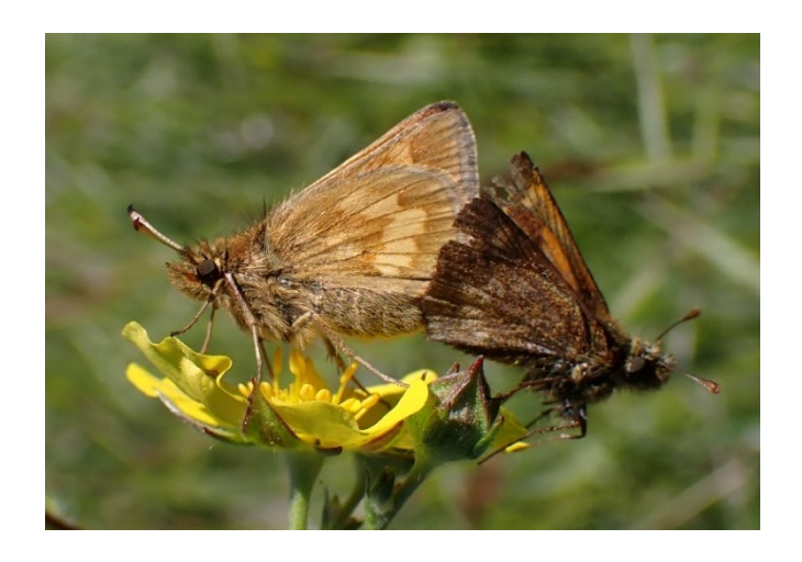
Figure 1 . Female (left) and male (right) Mardon Skipper .

The mardon skipper was a federal candidate for Endangered Species Act listing from 1999-2012. After extensive surveys that documented many previously unreported populations, the U.S. Fish and