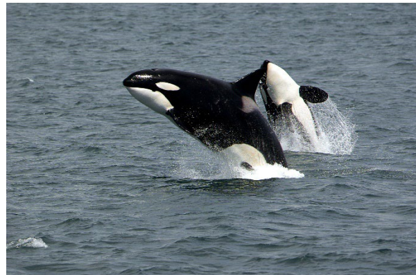
Figure 1. Killer whales.

Killer whales are the world's largest dolphin and have a striking black-and-white appearance. Males average 6-8 m in length and 3,600-5,400 kg in weight; females average 5-7 m and 1,300-2,700 kg. Males have larger dorsal fins, pectoral flippers, and tail flukes than females. More detailed descriptions appear in Shirihai and Jarrett (2006) and Jefferson et al. (2008).