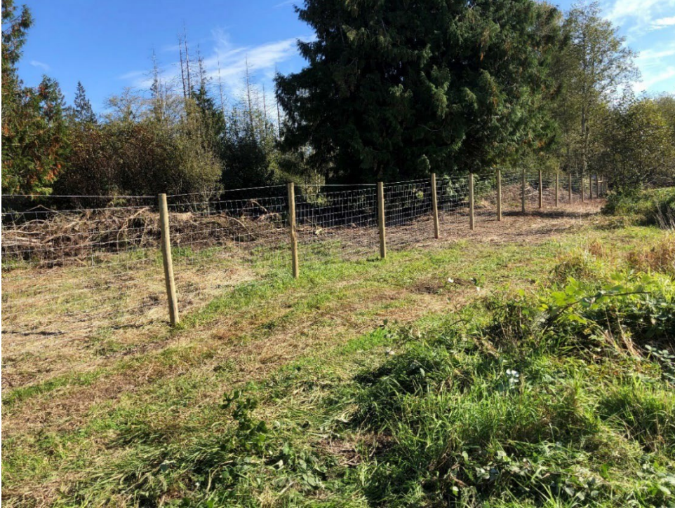
Completed woven wire fencing on property adjacent to SR20.