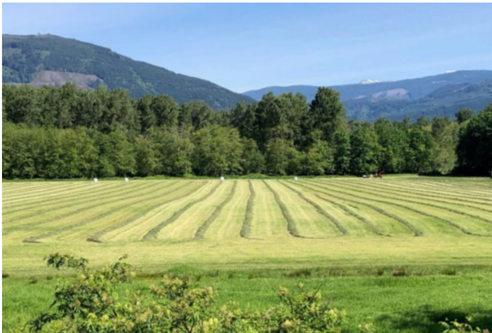
Hay field in Day Creek that was cut early after being fertilized with funding from the Crop Mitigation Program.