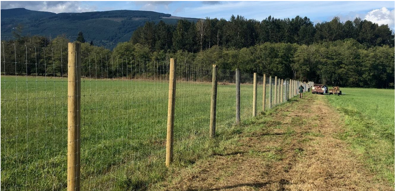
Fencing project in Day Creek.