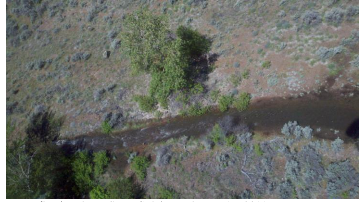
Water flowing down Stray Gulch Road, May 17, 2011.

Please see the photograph below, clearly showing water running down the Stray Gulch Road in May 17, 2011.