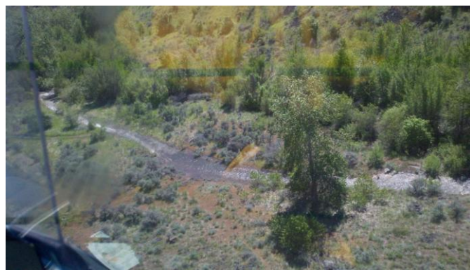
Water flowing down Stray Gulch Road, May 17, 2011

This photo shows water running down a lengthy portion of the Stray Gulch Road, well within the proposed closure area.