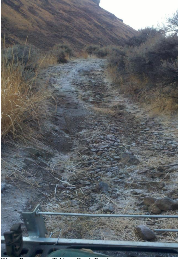
Water Damage on Tekison Creek Road

Hunters and campers will still have access to these areas for recreation. Numerous motorized vehicle campsites are being retained in the lower sections of both project areas.