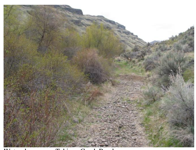
Water damage on Tekison Creek Road

Research studies have overwhelmingly shown the negative impacts of stream-adjacent roads to aquatic life. Primitive, unmaintained roads such as these can channel water down the road, carrying sediments back to the stream. The photo below shows a portion of the Tekison Creek Road, after high-flow events have removed substantial amounts of soil.