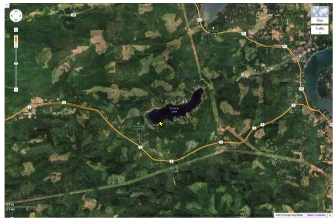
Approx. site location