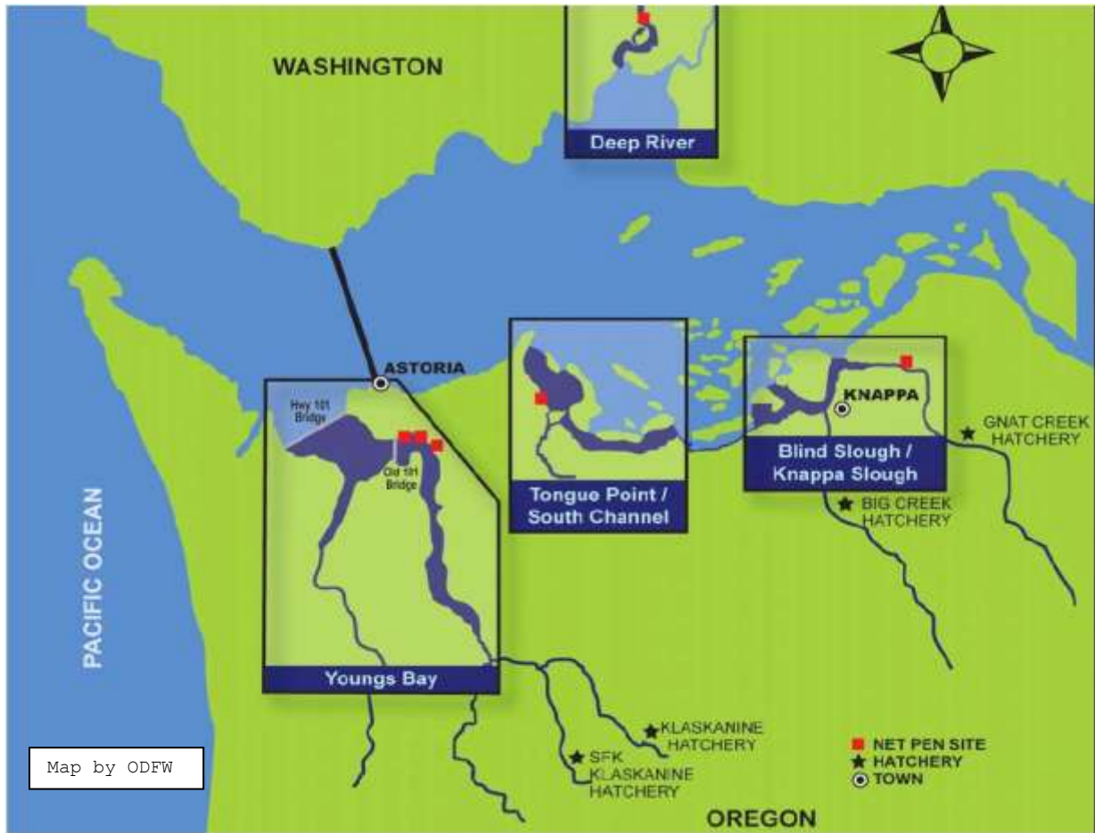
Figure 1. Map of Current Lower Columbia River Select Areas - (Youngs Bay = Zone 70; Tongue Point / South Channel = Zone 71; Blind Slough / Knappa Slough = Zone 74; and Deep River = Zone 80)