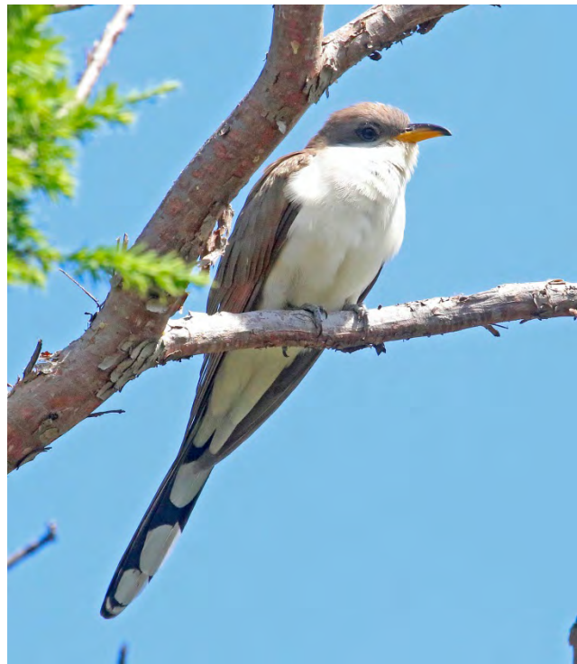
Figure 1. Western Yellow-billed Cuckoo.

Yellow-billed Cuckoos are medium-sized birds featuring unmarked grayish brown upper plumage, white underparts, large reddish brown wing patches, a long brown tail marked with bold white spots, and a mostly yellow, curved bill (Figure 1). Birds measure about 30 cm (12 in) in length and weigh about 60–80 gm (2.1–2.8 oz); females average slightly larger than males (Hughes 2015). Birds in western North America are slightly larger than those in eastern North America (Franzreb and Laymon 1993, Hughes 2015). The species gives a variety of vocalizations, the best known of which is a rapid guttural ka, ka, ka, ka, ka, kom, kom, komlp, komlp, komlp (Payne 2005 Hughes 2015). Other calls include a knocking-like kom, kom, kom, kom and a series of cooing notes.