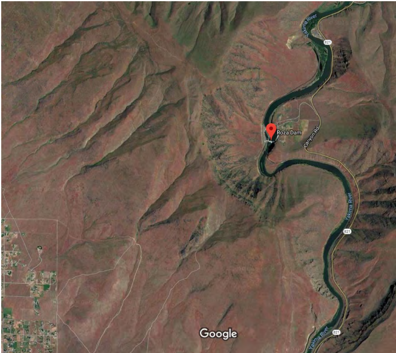
Imagery ©2018 DigitalGlobe, Landsat / Copernicus, USDA Farm Service Agency, Map data ©2018 Google 2000 ft