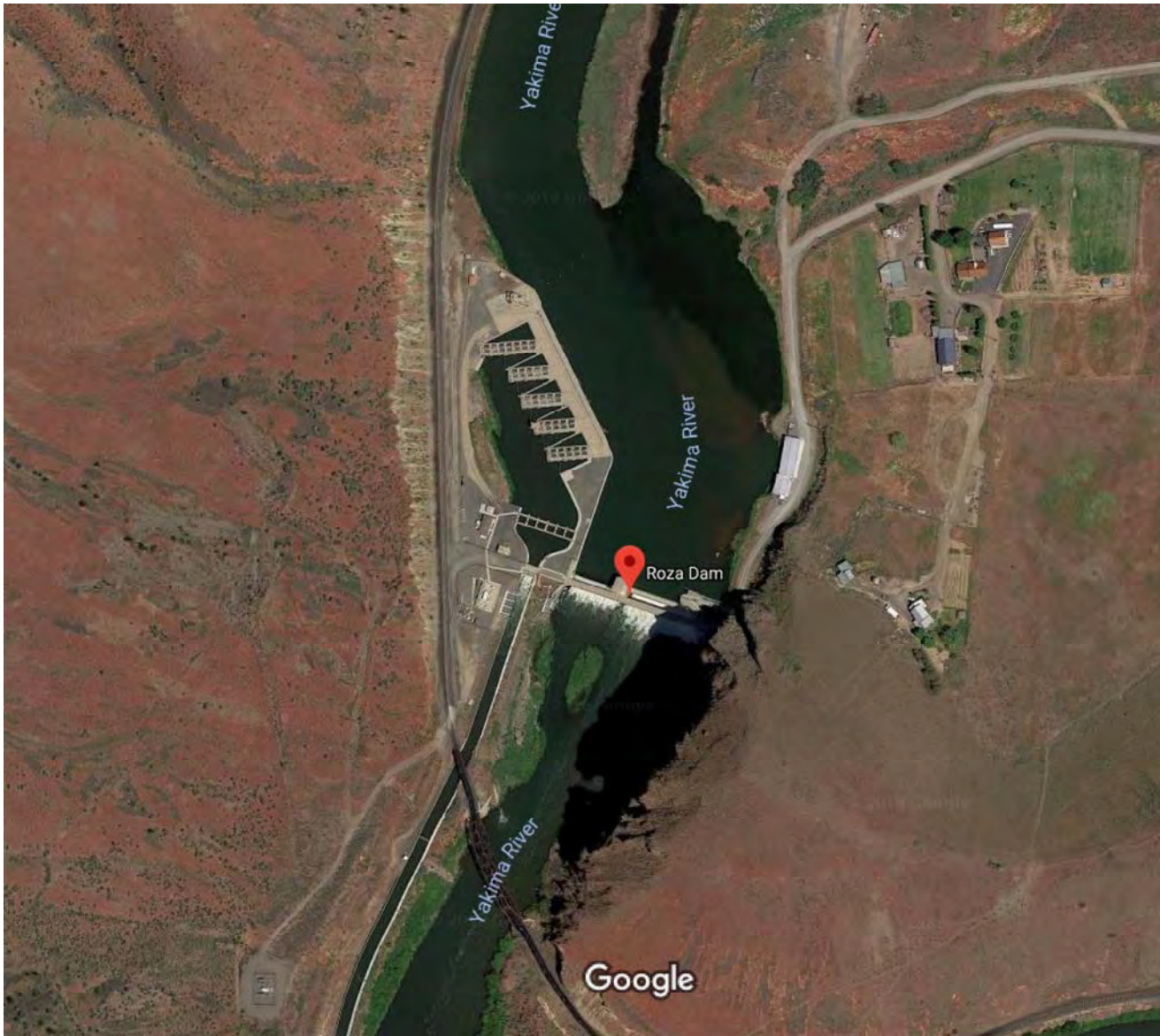
200 ft